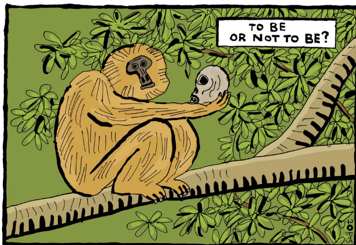
Many monkeys teeter on brink of extinction